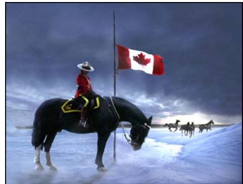
Dedicated to Our Four Fallen RCMP Members