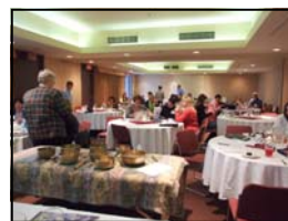
Lunch break at the 2007 AGM

This excerpt is from the book— "For Today and Tomorrow" by SGI President Daisaku Ikeda.