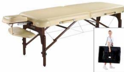
The Bristol™ Massage Table